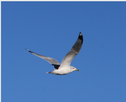
Emmett Sullivan gets a beautiful shot of a ring-billed gull near West Mineral, January 2, 2022.