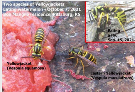
Bob Mangile discovered the differences between two species of yellow jackets in his yard this fall. Note the different patterns.