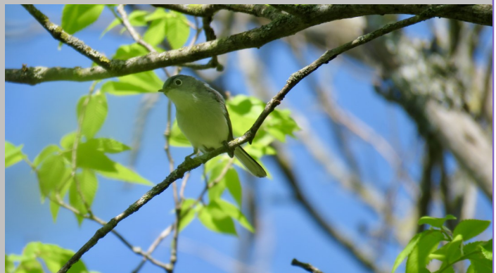
Nashville Warbler