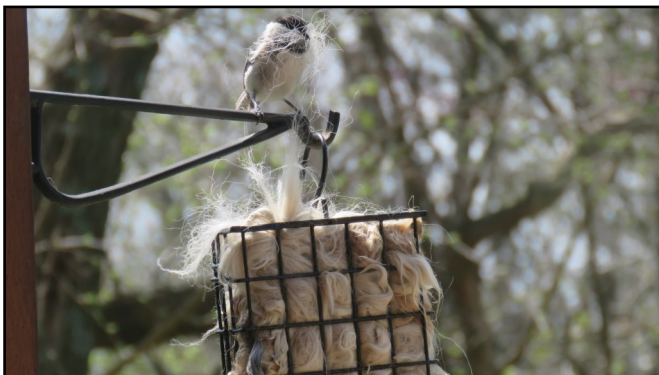
Carolina Chickadee's Nest Materials