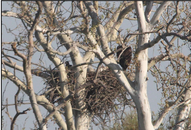
Bald Eagle and Nest

Beginning balance----- $4688.02 Credits Membership and 2 birdhouses----- $ 54.00 Total----- $ 54.00 Debits Earth Day brochures----- $ 83.92 Total----- $ 83.92 Ending balance----- $4658.10