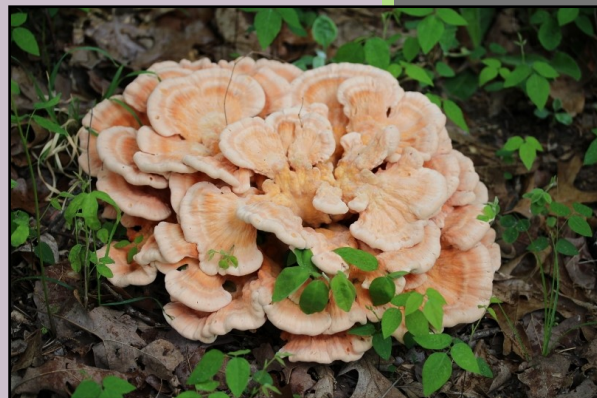
Chicken of the Woods