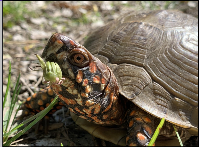
Male Eastern Box Turtle