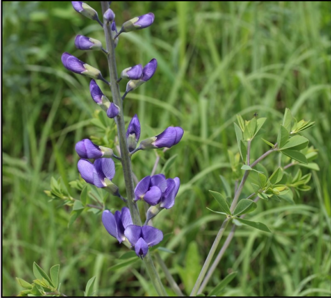
Blue False Indigo