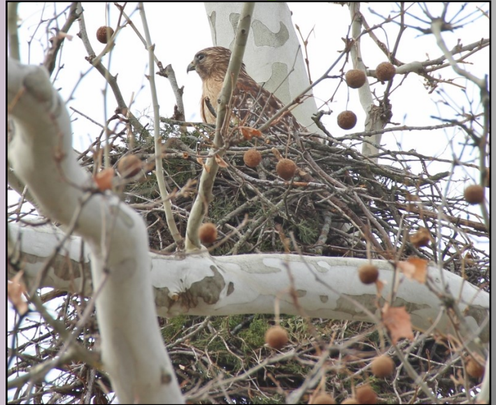
Harlan's Red Tail