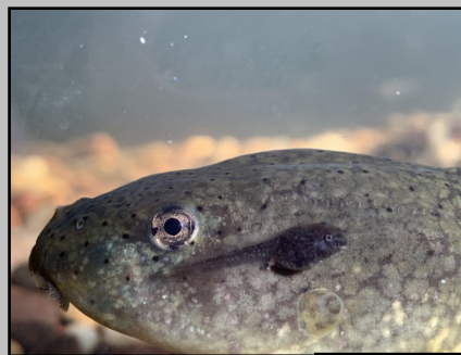
Bullfrog Tadpole and Adult