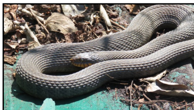
Plainbelly Watersnake